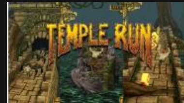
Temple Run (Coming Soon)